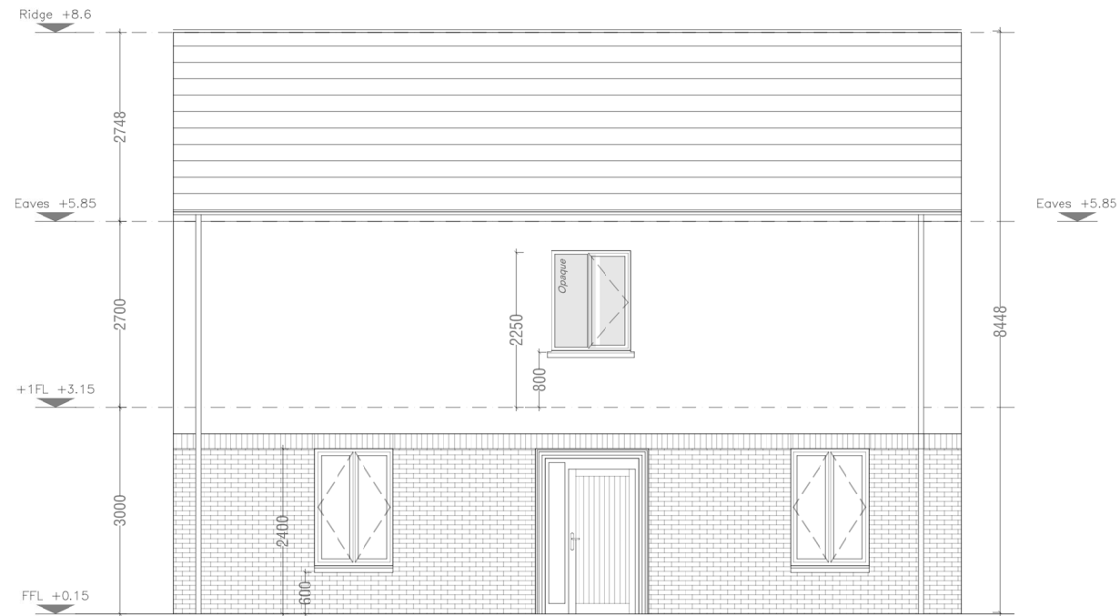
House Type R2 Detached Side Elevation